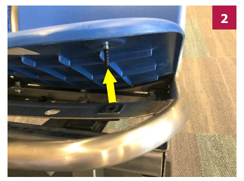
Then, pry away the seat cushion onsert to release two serrated studs from the retainer assembly at each corner.