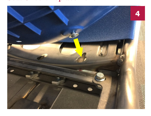
Insert the two washer heads into the larger openings of the keyways on the seat module.