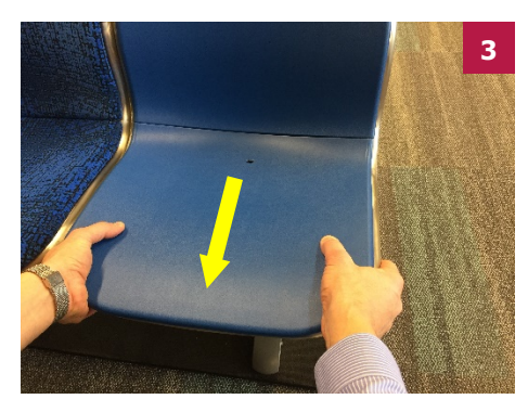
Pull the onsert forward to disengage the two washer heads from the smaller opening of the keyway slots in the seat module, then pull the seat onsert upward to remove out of the larger opening.