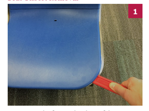
Starting at the front side edges of the seat cushion onsert, slide a pry tool between the onsert and the seat frame and rotate.