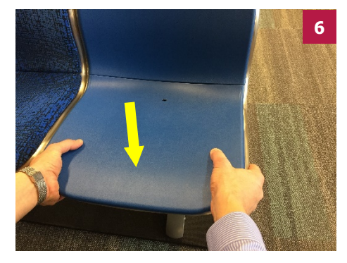
Next, firmly depress the two serrated studs into the retainer assemblies of the seat module. Audible clicking will be heard, push down until clicking stops.

NOTE: Check that all four corners of the onsert are firmly secured to the seat module. If any corner of the onsert is not secured, remove and replace the onsert. Be sure that the washer heads are fully seated behind and to the narrow end of the keyways in the module. If the serrated studs are not secure and have not made a clicking sound during assembly, check the condition of the retainer assembly. See Stud Retainer Assembly instructions as required.