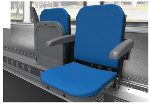
BC55-NU (Non-Upholstered) - with Armrests