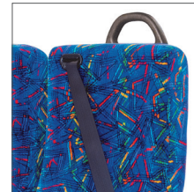
TOP-MOUNTED GRAB HANDLE