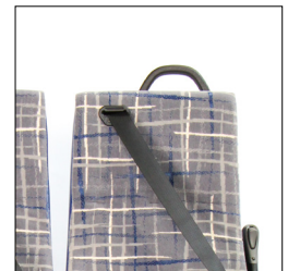
Top-Mounted Grab Handle